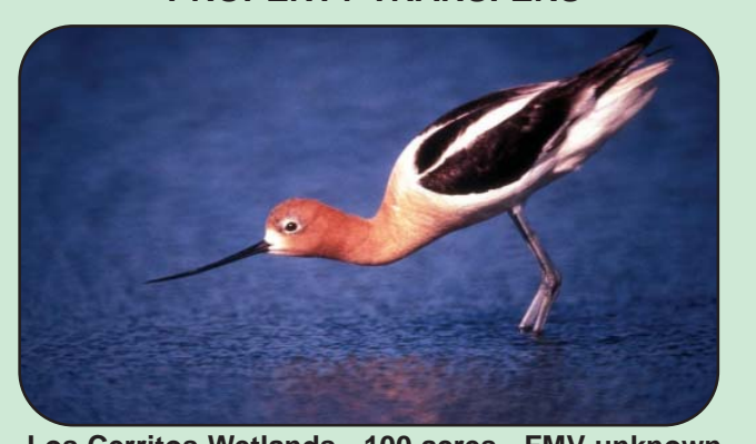
Los Cerritos Wetlands - 100 acres - FMV unknown Sunset Ridge - 12 acres - FMV $1,300,000

In 2008, a land swap was proposed to preserve 175 acres of Los Cerritos Wetlands in Long Beach. Fifty-two acres of City-owned property could be traded for acreage in the heart of the Los Cerritos Wetlands. The City would then sell the marsh to the Los Cerritos Wetlands Authority for about $25 million and use the proceeds to acquire 20 acres along the L.A. River for recreational open space. In 2006, after abandonment of the Pacific Coast Freeway in the 1970s, 15 acres of right-of-way owned by Caltrans was rezoned for a condominium development. Residents fought hard to retain this coastal site as open space. State legislation finally allowed transfer of the site from Caltrans to State Parks and subsequently back to the City of Newport Beach for park use. The cost to Newport Beach was $1.3 million, the amount originally paid by Caltrans for the right-of-way.