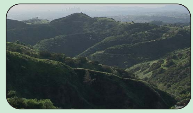
Turnbull Canyon - 951 acres - FMV $14,000,000,

In 2002, after a nine year battle the property known as Turnbull Canyon was purchased in perpetuity. The land, owned at the time by the Rose Hills Foundation and its counterpart the Los Angeles Archdiocese, had a proposed cemetery on the Canyon's steep and well vegetated slopes. The Puente Hills Landfill Native Habitat Preservation Authority stepped in and was able to purchase it because of a landfill mitigation fee. This fee, a $1 surcharge for every one ton of trash dumped at the Puente Hills Landfill, is a unique funding source. Eventually, and as per the usual, several funding sources from project partners (US Fish and Wildlife Service and Department of Fish and Game) were needed to complete the conservation transaction. Now landfill mitigation fee programs are being established in Orange County because of this excellent example.