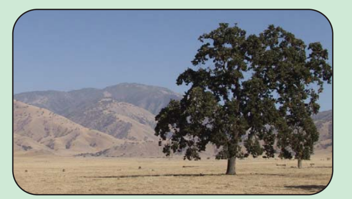
Tejon Ranch - 240,000 acres - FMV unknown

In 2008, the Planning and Conservation League, Audubon California, Sierra Club, Endangered Habitats League and the Natural Resources Defense Council signed a Conservation and Land Use Agreement with the Tejon Ranch Company. The Ranch is the largest contiguous privately owned property in the state. The Agreement protected 90% (or 240,000 acres) of the Tejon Ranch. California comes together at Tejon Ranch, as the Ranch lies at the confluence of four major ecological regions. It sits at the southernmost end of the Central Valley, provides a buffer from the Los Angeles Basin, and connects the southern Sierra on the east to the Coast Range on the west. The agreement, created the Tejon Ranch Conservancy, which is funded by transfer fees.