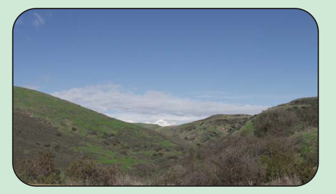
Shapell C - 1,262 acres - FMV $3,100,000

In 2006, the 1,262-acre Shapell C site in eastern Yorba Linda was donated to the California Department of State Parks with a $500,000 endowment. This property was added to Chino Hills State Park. The landowner, Shapell, was required to donate this property as mitigation for building on California gnatcatcher habitat in the nearby hills. This particular ridgeline property was the subject of Hills For Everyone's first lawsuit in a battle to protect the Park's ridgeline. The suit was lost on a technicality in 1981 and yet in the long term, the war was won and the ridgeline was protected 25 years later. The lesson is that in fighting for this ridgeline, the message about the site's importance to the Park was delivered and it was ultimately protected.