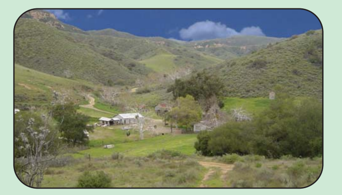
Hidden Ranch - 814 acres - FMV $4,815,000

In 2004, the Trust for Public Land (TPL) negotiated a conservation transaction to purchase fee title of the 814-acre Hidden Ranch property. Nestled in the canyons of the Cleveland National Forest, the property was acquired due to its significant natural resource values. Working with TPL staff, the Wildlife Conservation Board (WCB) allocated $15 million for land acquisition in Orange County, specifically focused on coastal sage scrub habitat. TPL worked with the landowner to have the property appraised and determined its fair market value (FMV) to be $4.8 million. TPL purchased it using the WCB grant and eventually this property was transferred to The Wildlands Conservancy for permanent protection with deed restrictions.