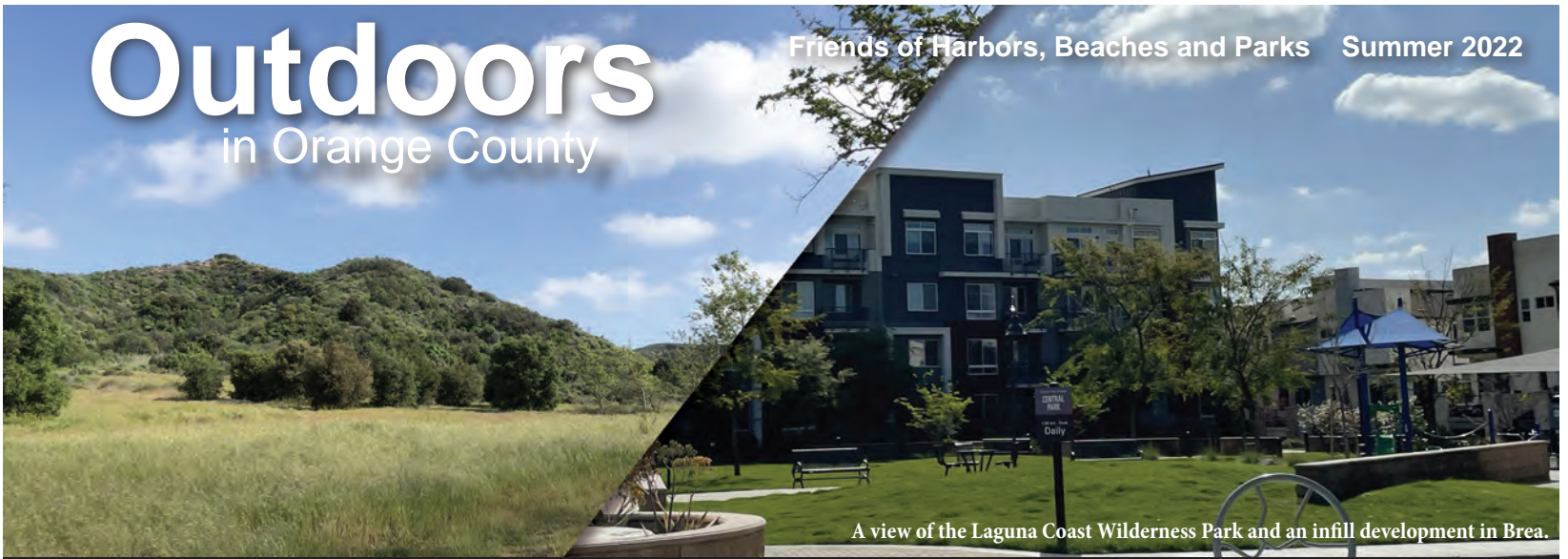
A view of the Laguna Coast Wilderness Park and an infill development in Brea.