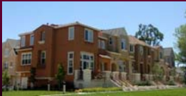
Newport Beach General Plan

Require that residential units be developed at a minimum density of 30 units and maximum of 50 units per net acre averaged over the total area of each residential village.