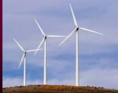
County of Orange General Plan

Achieve a reduction in projected per capita energy demand and consumption by the year 2005.