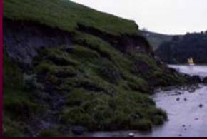
Aliso Viejo General Plan

Avoid development in areas susceptible to erosion and sediment loss.