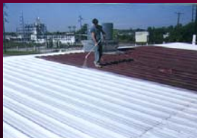
Westminster General Plan

Reduce the roof temperature by specifying cool roof products that meet Energy Star levels of efficiency.