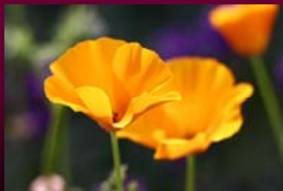
Brea General Plan

Require the use of drought resistant plant species (native species where possible) in landscaping for private and public areas, including parks.