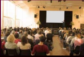
Stanton General Plan

Increase public awareness regarding air quality, global climate change gases, implementation issues, reporting, and enforcement through internet resources, public presentations, booths, or kiosks.