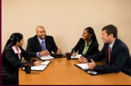
La Palma General Plan

Assist 5 first-time homebuyers by providing tax credits.