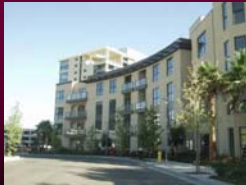
Laguna Hills General Plan

Establish developer incentives to encourage well-designed mixed use and infill development projects in these areas.