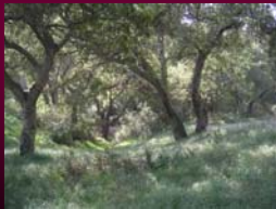
Rancho Santa Margarita General Plan

Continue to preserve the coast live oak woodlands in the City by retaining the habitat as open space.