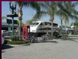
Anaheim General Plan

Provide convenient connections and shuttle services from commuter rail stations to employment centers and entertainment venues.