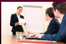
Seal Beach General Plan

Review any development application for shoreline construction with respect to the effects of beach encroachment, wave reflection, flood and wave hazards, public access and public recreation, shoreline sand supply, and aesthetics.