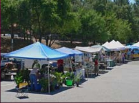
Laguna Hills General Plan

Improve access to healthy and local food by encouraging community gardens, farmers markets, and farm-to-school programs.