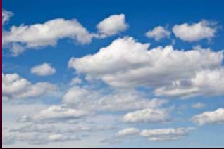
Laguna Beach General Plan

Reduce greenhouse gas (GHG) emissions 80% below 1990 levels by 2050.