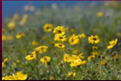
Seal Beach General Plan

The City should explore all sources of possible federal, state, and county funding for open space lands, and the conversion of surplus public lands to open space.