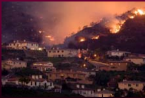
Yorba Linda General Plan

Institute a “High Risk Fire Hazard Area” and establish development standards which will reduce the risk for wildfires.