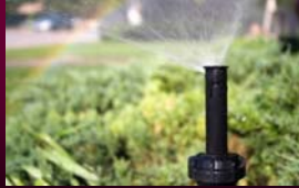
Mission Viejo General Plan

All new commercial development shall install and utilize non-domestic water facilities for use in irrigation whenever feasible.