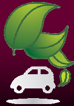
Santa Ana General Plan

Buy or lease fuel-efficient vehicles for City use—provide standards for use by operators.