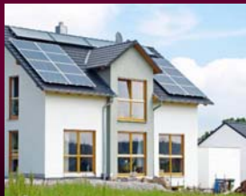
Dana Point General Plan

Encourage the use of solar energy to supplement conventional heating systems.