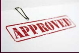
Cypress General Plan

Provide priority development review processing for low and moderate income housing applications.