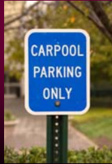
Irvine General Plan

Preferential and free parking for carpoolers and vanpoolers.