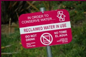
Huntington Beach General Plan

Require use of reclaimed water for landscaping, grading, and non-contact uses.