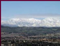
San Juan Capistrano General Plan

Ensure that no buildings will encroach upon any ridgeline designated for preservation.