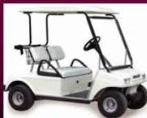
Laguna Woods General Plan

Maintain and enhance infrastructure to promote alternative vehicle access where feasible.