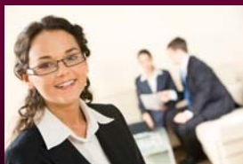
Huntington Beach General Plan

Increase vehicle work trips by transit from 5.1% in 1984 to 19.3% in 2010.