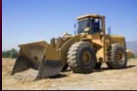
Lake Forest General Plan

Conserve and protect important topographical features, watershed areas, and soils through appropriate site planning and grading techniques, re-vegetation and soil management practices, and other resource management techniques.