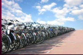
La Habra General Plan

Require that a percentage of required parking spaces in new developments be set aside for bicycles.