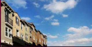
Garden Grove General Plan

Encourage infill development projects within urbanized areas that include jobs centers and transportation nodes.