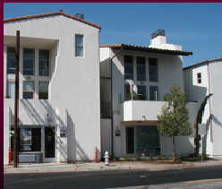
Fountain Valley General Plan

Maintain and continue to enhance high quality mixed use development throughout the City.